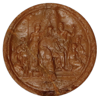
L-R SEAL FROM THE LETTERS PATENT - SRSA COLONEL GEORGE GAWLER, C.1848-50 - AGSA

A period of intense negotiation followed between those planning to establish the province of South Australia and the Colonial Office, which administered Britain's colonies. One of the topics under discussion was provision for the Aboriginal inhabitants, particularly in relation to their proprietary rights to land; rights which those in the Colonial Office believed were beyond dispute. The Colonization Commissioners, seeking to establish the province, disputed that such rights would be found to exist, believing that Aboriginal people did not 'occupy' the land in a way that would be recognised by British institutions.